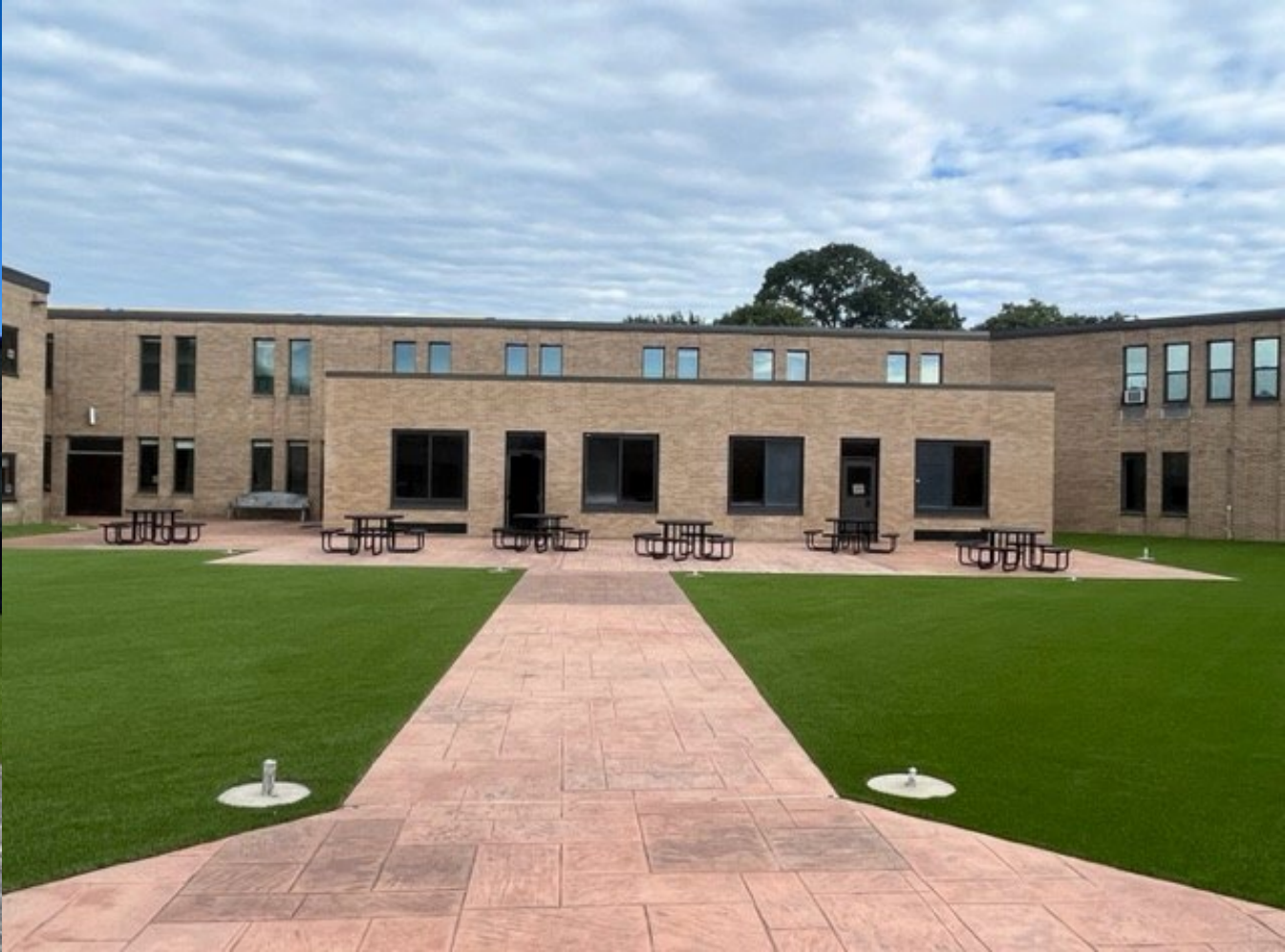
CHS COURTYARD WEST