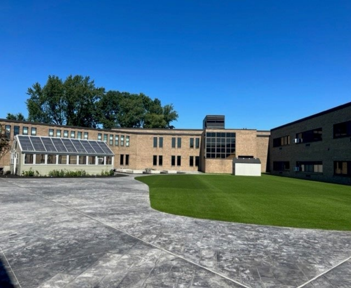
CHS COURTYARD EAST