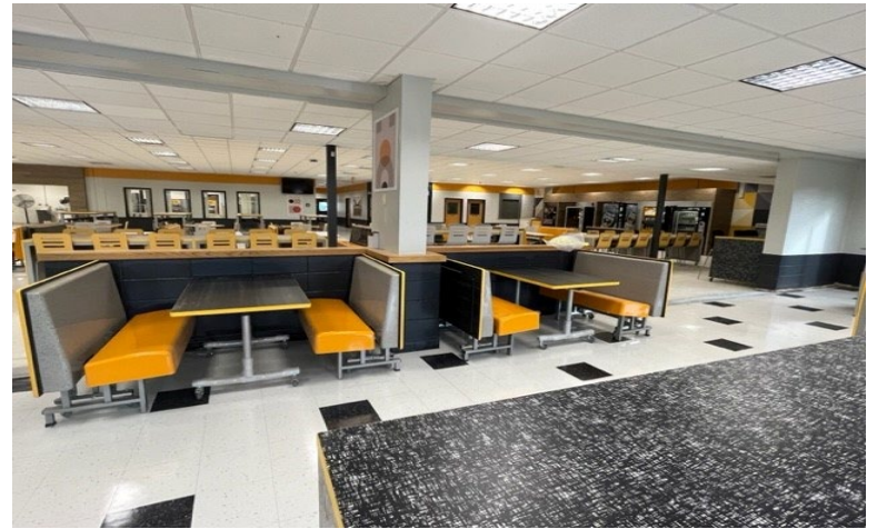
Commack High School Cafeteria