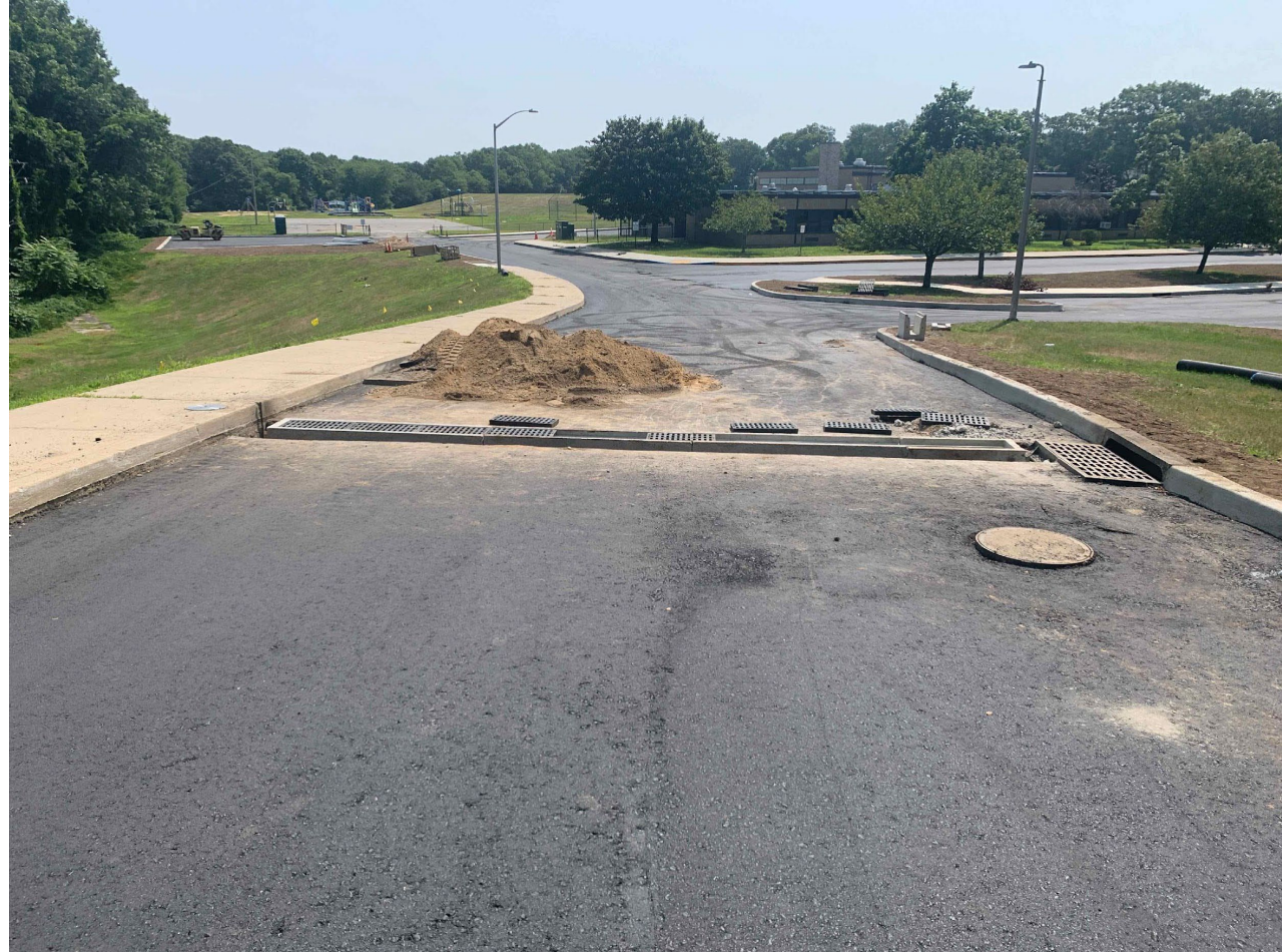
INDIAN HOLLOW PARKING LOT