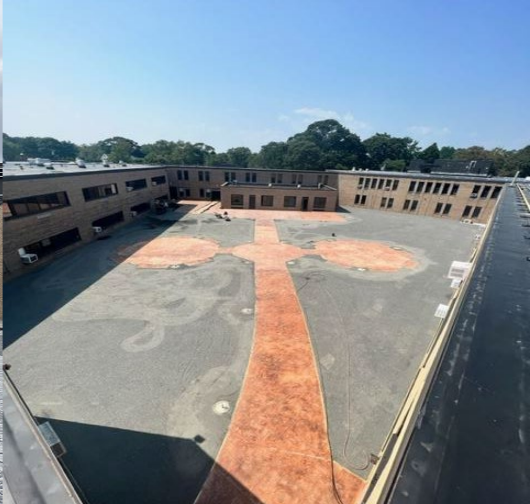
CHS COURTYARD WEST