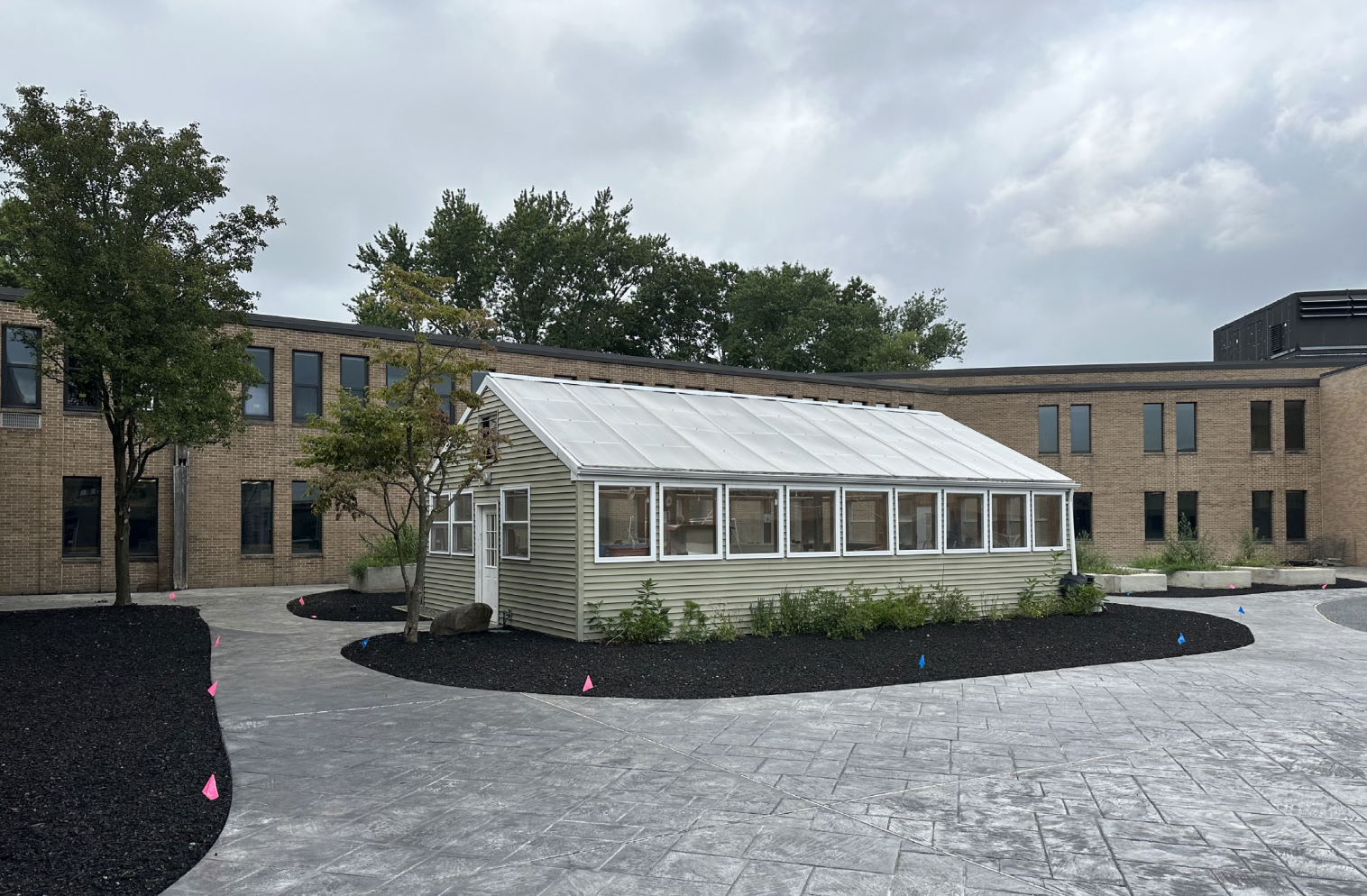
CHS COURTYARD EAST