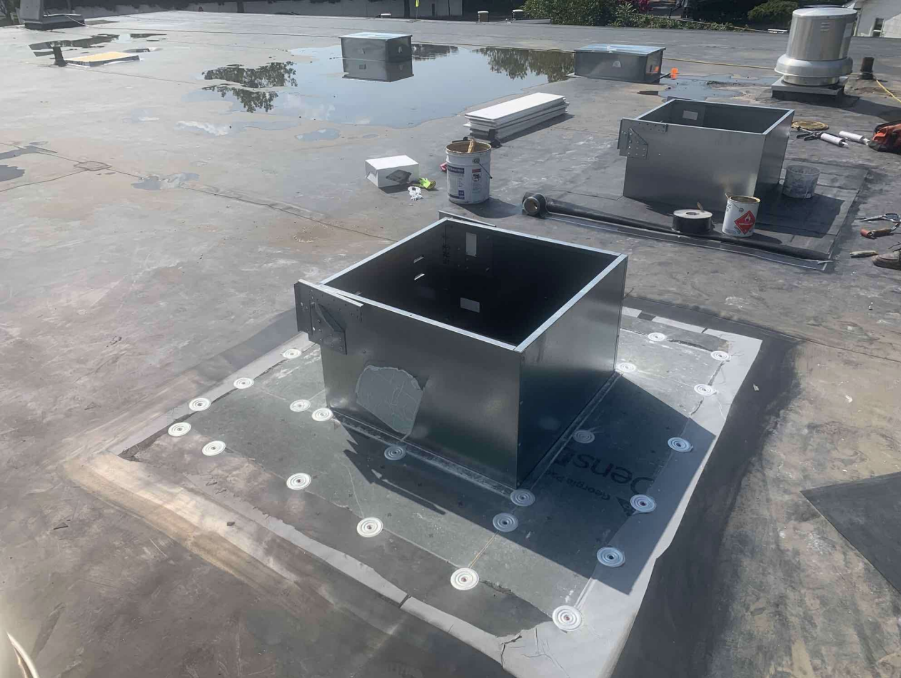
HS KITCHEN ROOF