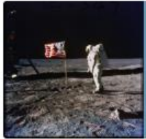
Race to the Moon