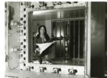
Women in Science