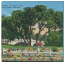
Urban Parks in the United States