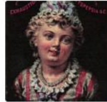
Quack Cures and Self-Remedies: Patent Medicine