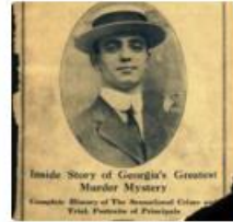
Tragedy in the New South: The Murder of Mary Phagan and the Lynching of Leo Frank