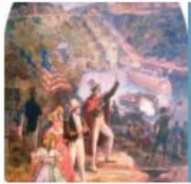
Two Hundred Years on the Erie Canal