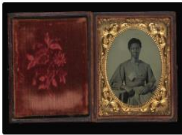
American Civil War

This is a new feature designed to showcase content strengths in our collection. Look for new topics in the future!