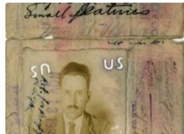
Immigration since 1840