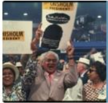
Battle on the Ballot: Political Outsiders in US Presidential Elections