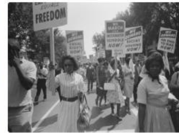
Civil Rights Movement