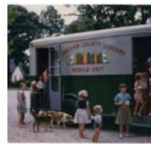
A History of US Public Libraries