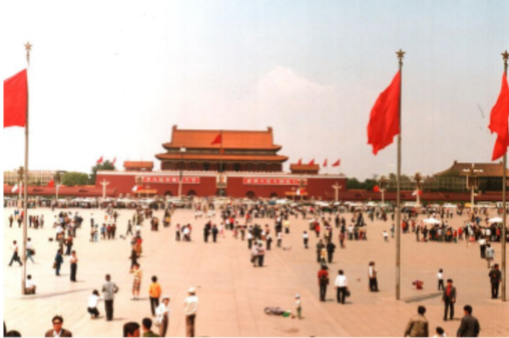
Tiananmen Square in 1988 a year before pro-democracy protests and the violent government crackdown.

Estimates of civilian deaths which resulted vary: 400-800, 1,000 (NSA), and 2,600 (Chinese Red Cross). Student protesters maintained that over 7,000 protestors were tortured and killed. Following the violence, the government conducted widespread arrests to suppress, torture, and kill the remaining supporters of the movement, limited access for the foreign press, and controlled coverage of the events in the mainland Chinese press. The violent suppression of the Tiananmen Square protest caused widespread